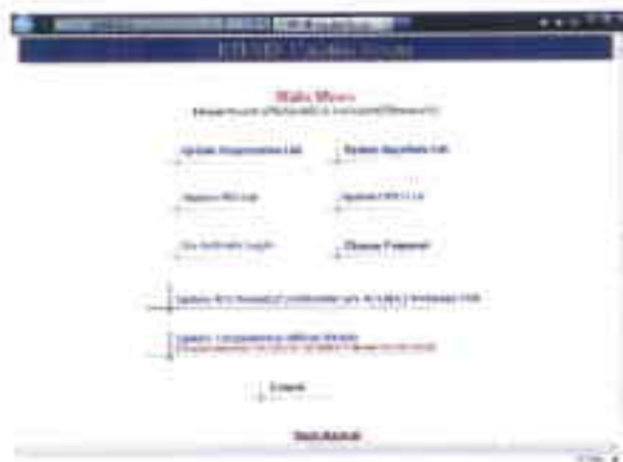
RTI-MIS Updation System