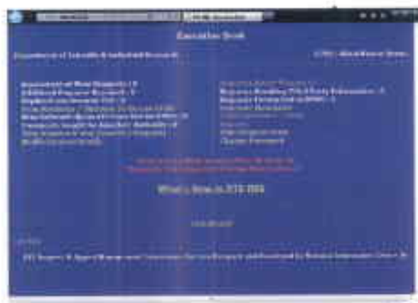
RTI Request & Appeal Management Information System