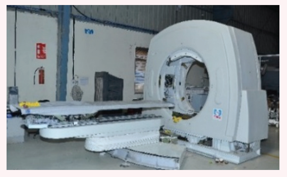
Spiral Cobalt Radiotherapy Machine

cancer. The company has developed fully functional prototypes for Rotational Gamma Beam machine to achieve conformal therapy. The developed machine is able to offer the 3D conformal therapy using cobalt 60. The overall cost of treatment delivery with such a configuration will be lowest, while offering the 3D conformal treatment. Isotope based teletherapy machine work with maximum advantage when the distance from source to tumor is lower. This machine offers a very low distance of 60 cm. This is a major breakthrough in tele-therapy and it will be first of its kind Made in India product in the world. This Spiral Cobalt Radiotherapy Machine is precise, accurate, rugged and reliable for conformal therapy at a fraction of the cost of competing technologies in developing countries. It is operated by a built in battery with low power consumption, suitable for rural India. Since the cost of this "Made in India" machine is about 1/4<sup>th</sup> of the other imported machines, this makes the equipment affordable and will get proper place in global competition and hence have huge marketing potential. The project has been completed successfully.