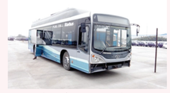
(Proto shown in Auto expo)

MORTH, buses are expected running on public road soon as demonstrator. One to two buses are expected to be brought to IOCL Faridabad. Tata Motors has collaborated with IOCL and facilitated creation of Hydrogen refuelling infrastructure at IOCL, R&D Faridabad for demonstration of buses for trail on road at Delhi- Faridabad. The Project is under progress.