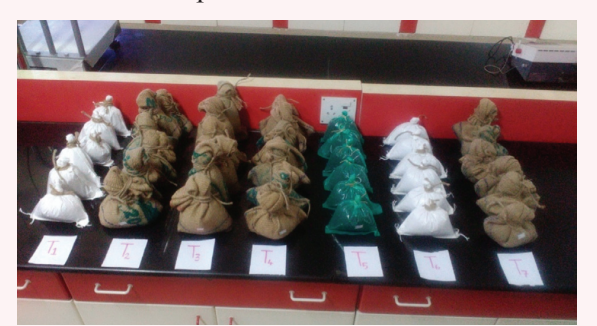
Different bags used to store pulses

Two in one trap was designed to control and monitor pulses. This setup consists of a hopper bottom bin painted both sides with yellow colour, which makes the trap more attractive to insects. This trap could collect insects more effectively. Usage of natural insect repellents in addition to light is also possible to attract more number of insects in short span.