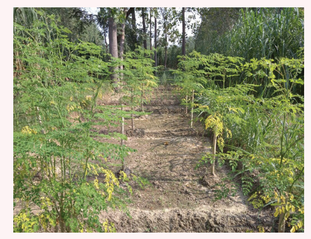
Moringa plantation at village Sandhawali, Dist. Muzaffarnagar

for personal health care, product development and their marketing for gainful employment and income generation. Training programmes are being conducted to educate and train the target group of women for the cultivation, processing, storage, pre and post-harvest methodology and techniques for the processing and cultivation of a number of selected medicinal plants. They will be encouraged to utilize the possibility of growing medicinal plants in home stead, kitchen garden or available under-utilized land and marketing for gainful employment. Some important medicinal plants having good market potential and utility in Indian system of medicines have been selected depending on the agro-climatic condition of the selected area. The project is being implemented through coordination with local NGOs, village panchayat, Gram Pardhan, Angan-wadi workers, local school teachers, Krishi Vigyan Kendras (KVKs), followed by formation of Self-Help Groups of the beneficiaries. Conducted 6 training programs in 4 villages namely Hussainpur Bopada, Ghasipura, Beghrajpur and Jaroda (Dist. Muzaffarnagar). A total of 129 rural women attended and participated in the training programmes. They were trained on the medicinal values of the selected medicinal and aromatic plants, their cultivation practices and method of preparation of herbal health care products from lemon grass and moringa.